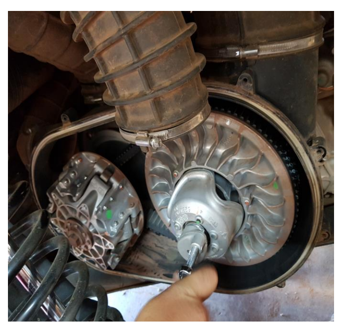
Figure 1- spread secondary(rear) pulley

1) Remove the drivers' side rear wheel. Remove cover bolts and plastic cover to expose CVT clutch system. Sometimes it is easier to remove cover if the vehicle is jacked up slightly in the center rear to extend suspension.